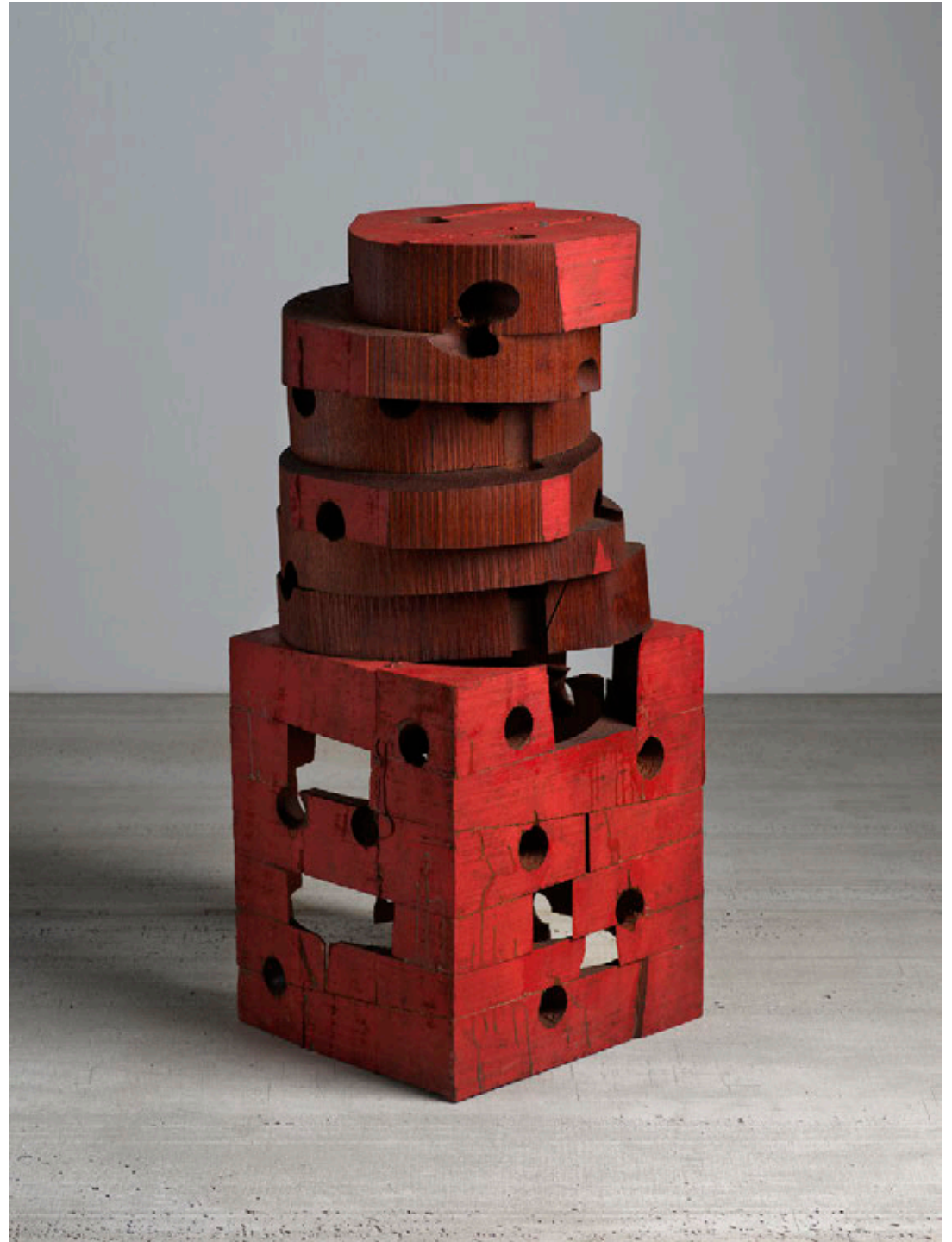
Untitled, 2007 mahogany and Japan color 32 x 12 1/2 x 12 1/2 in 81.3 x 31.8 x 31.8 cm (KEN1548)