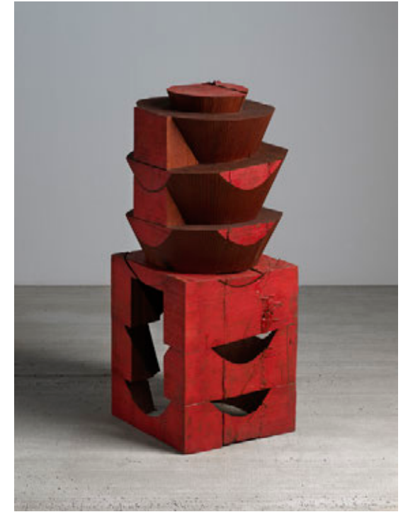
Untitled, 2007 mahogany and Japan color 31 1/2 x 12 1/8 x 13 in 80 x 30.8 x 33 cm (KEN2950)