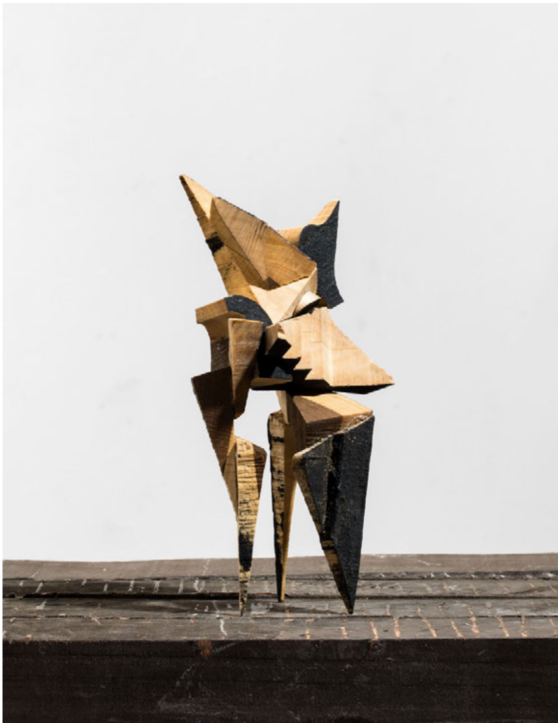
Untitled, 1992 poplar wood, oil, lamp black 9 1/2 x 5 1/2 x 4 3/4 in 24.1 x 14 x 12.1 cm (KEN7534)