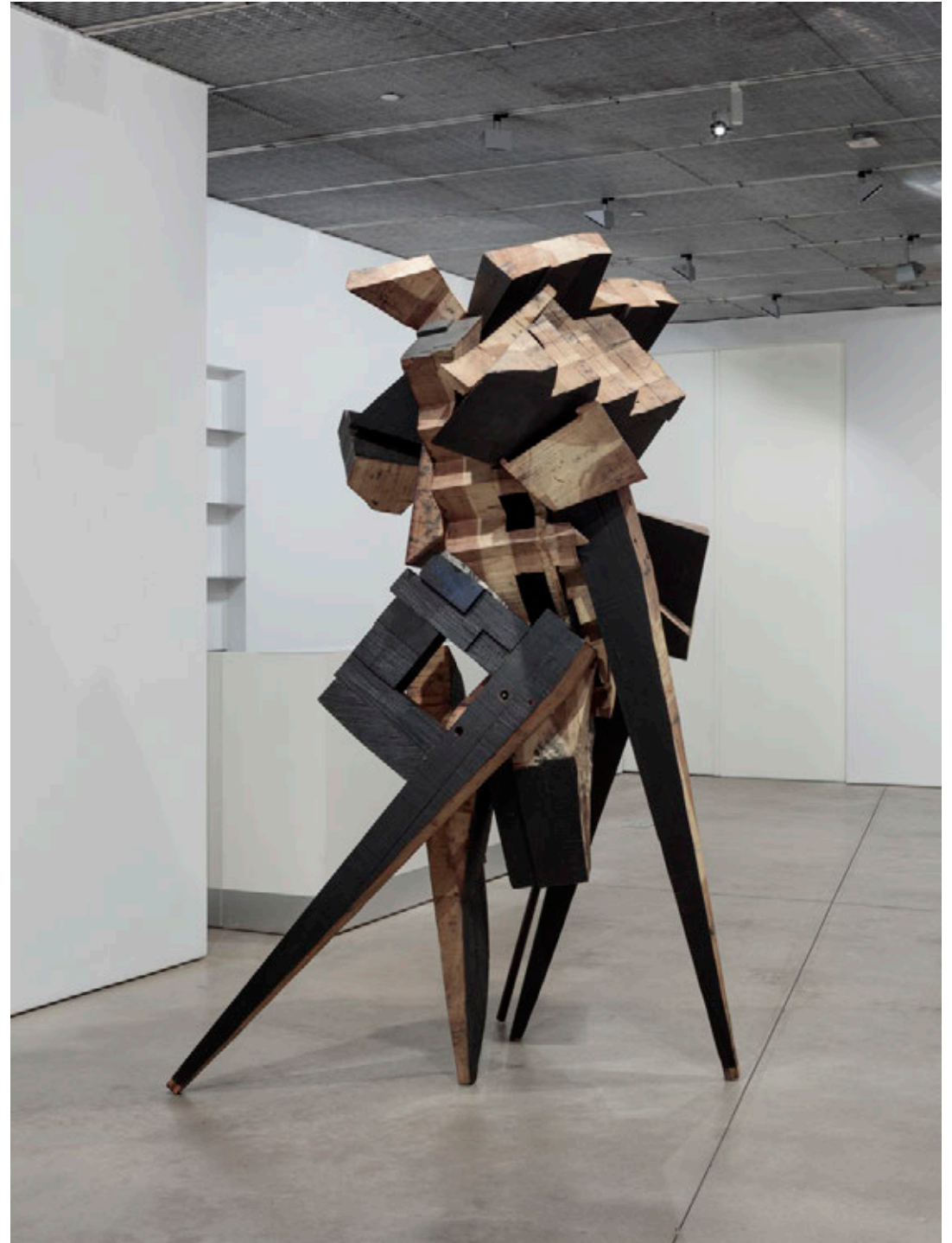
Sculpture No. 4 , 1991 poplar, steel, lampblack and linseed oil 108 x 57 x 53 in 274.3 x 144.8 x 134.6 cm (KEN6503)

Sculpture No. 4 will be installed independently from the booth, as part of a special Armory Show presentation located near the Armory Live Theatre