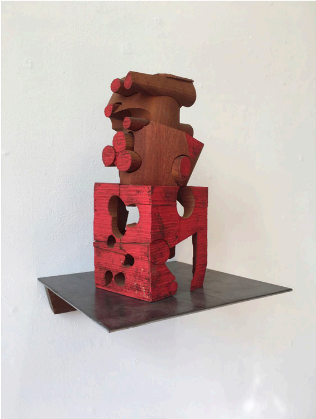
Untitled , 2011 mahogany and Japan color 10 3/4 x 4 1/4 x 4 1/4 in 27.3 x 10.8 x 10.8 cm (KEN6977)