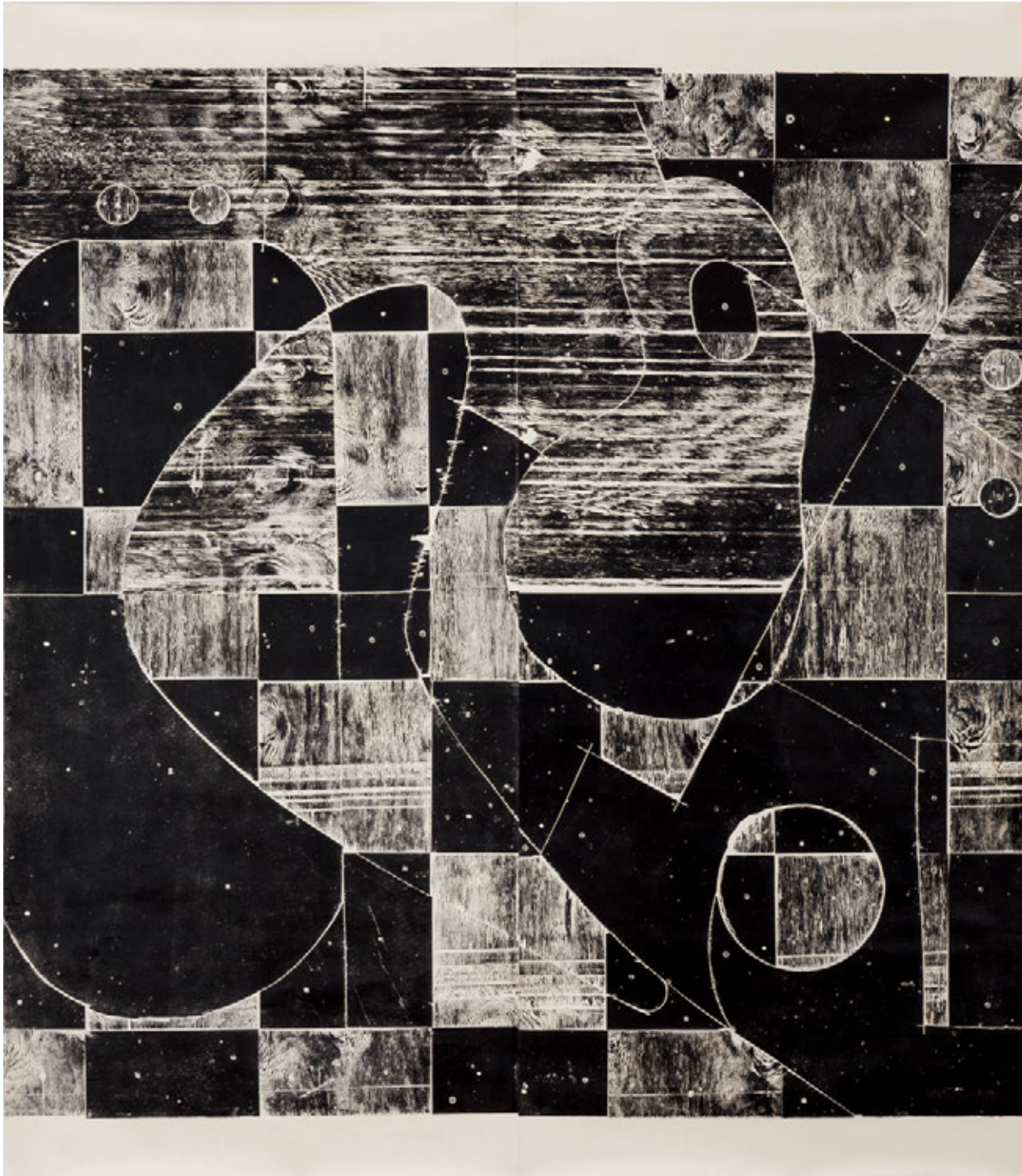
Map 2, 1993 woodblock on Kozo paper, mounted on canvas unique 107 1/2 x 94 in 273.1 x 238.8 cm (KEN6495)