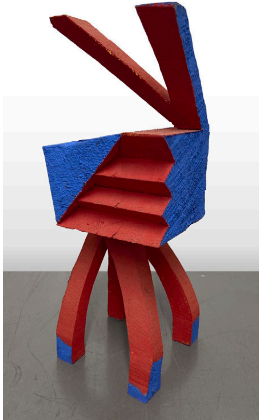
Untitled , 2003 wood and Japan color 11 x 4 x 4 1/2 in 27.9 x 10.2 x 11.4 cm (KEN7549)