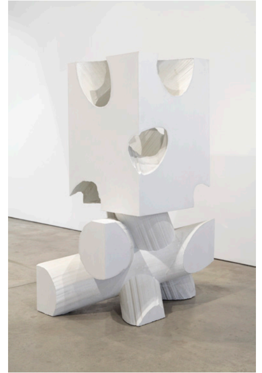
White Block/Tubes , 2015 precast concrete 60 x 24 x 36 in 153 x 61 x 91.4 cm (KEN5705)