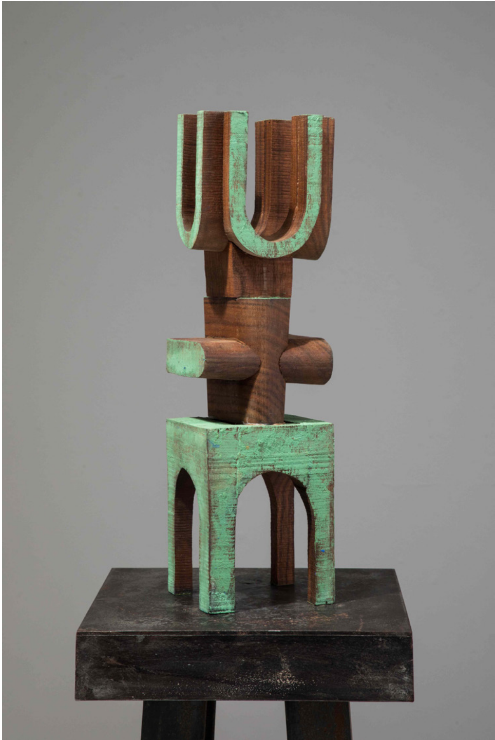
Green Tower , 2016 mahogany and Japan color 15 1/2 x 4 x 4 1/2 in 39.4 x 10.2 x 11.4 cm (KEN7545)