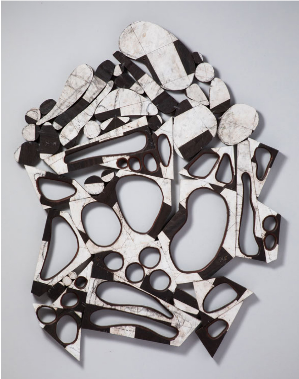
D2 , 2018 mahogany, Japan color, and charcoal 71 1/2 x 57 x 3 1/2 in 181.61 x 144.78 x 7.62 cm (KEN6748)