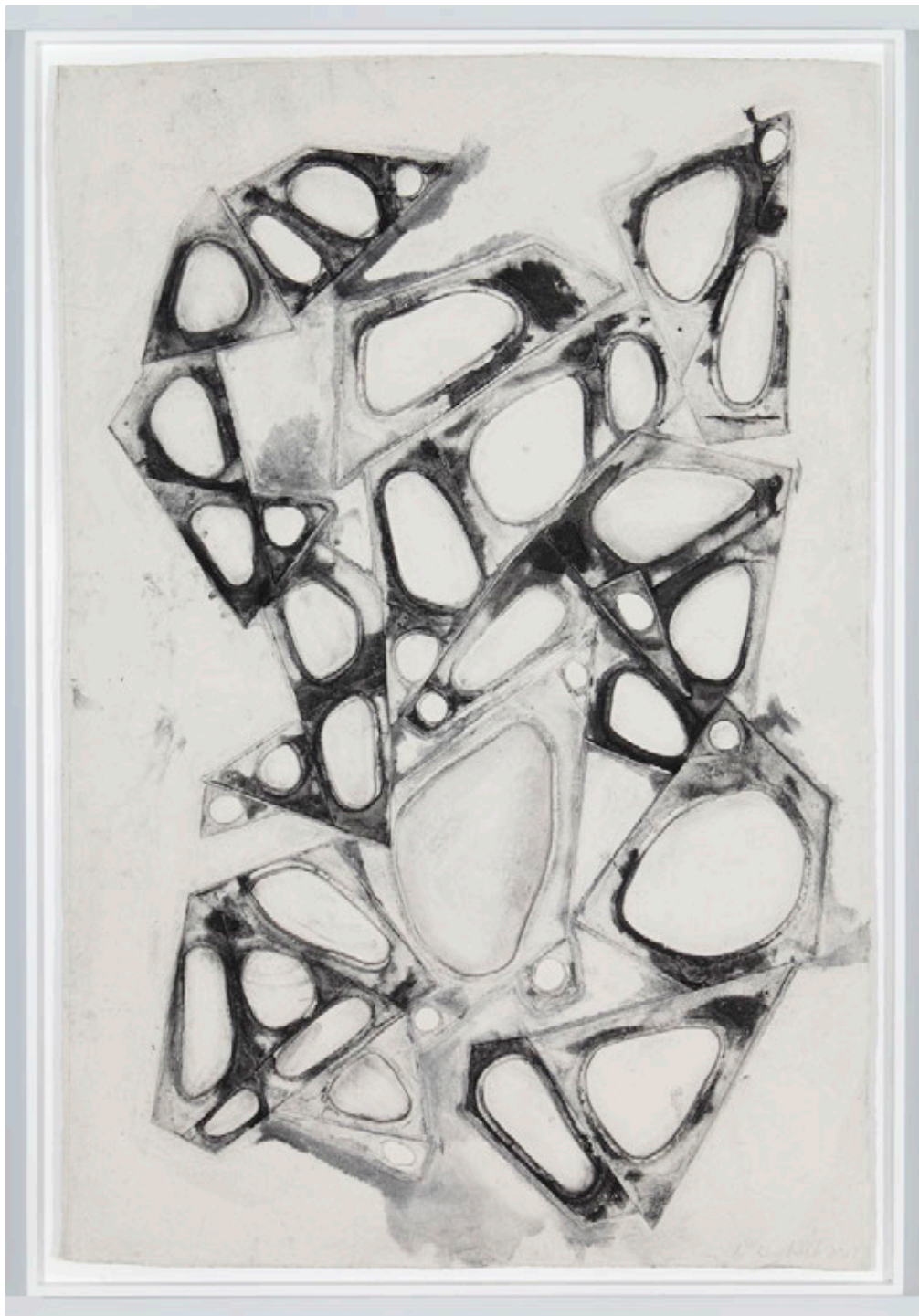
Water Drawing , 2012 cast paper with carbon black pigment 60 x 40 in 152.4 x 101.6 cm (KEN4135)