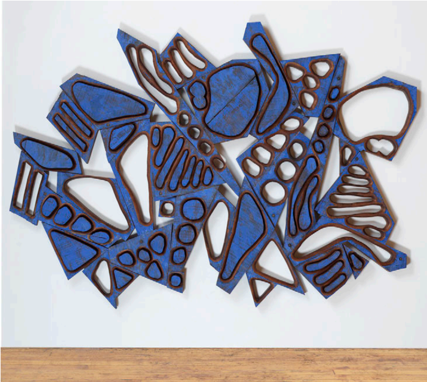
To be titled , 2020 mahogany with Japan color 70 x 100 x 4 1/4 in 177.8 x 254 x 10.8 cm (KEN7559)