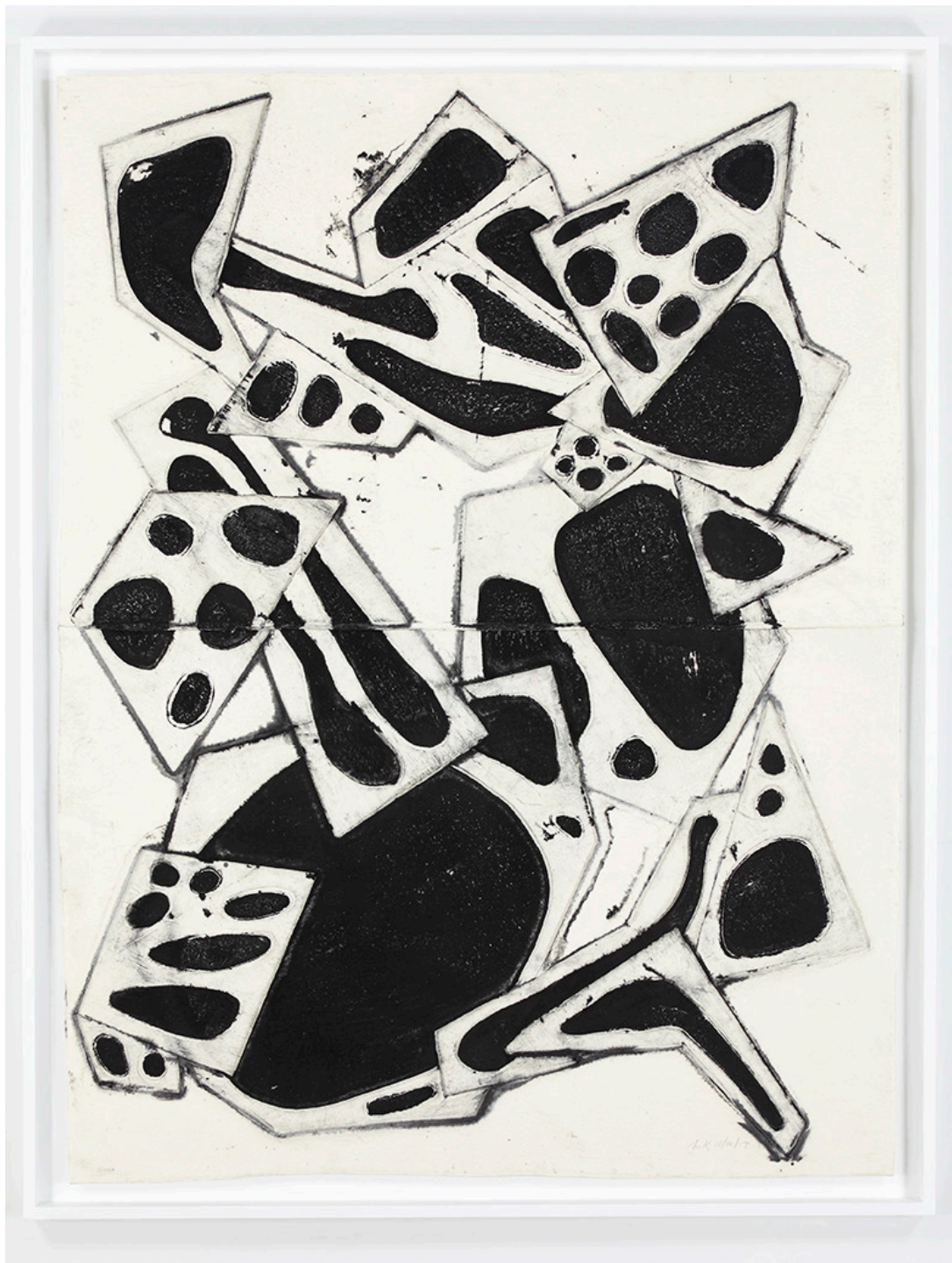
Double Water Drawing 10/16/13 (D) , 2013 cast paper with carbon black pigment 80 x 60 in 203.2 x 152.4 cm (KEN4935)