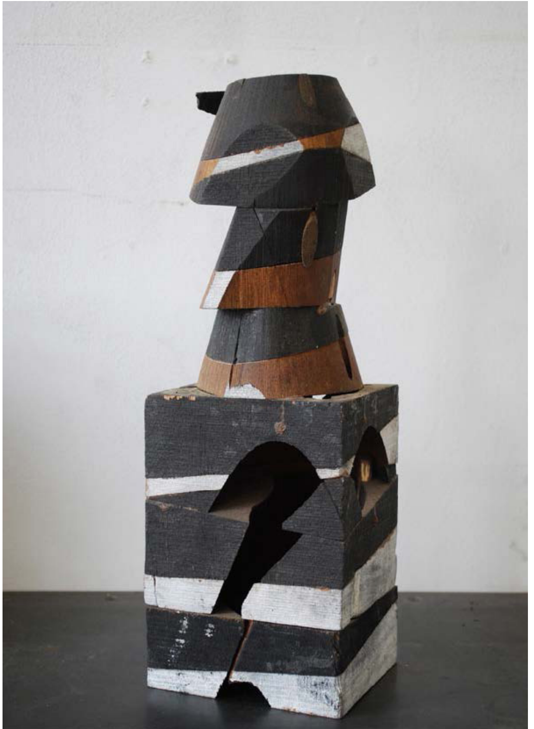
Untitled , 2011 wood and Japan color 12 x 4 1/4 x 3 1/2 in 30.5 x 10.8 x 8.9 cm (KEN7542)