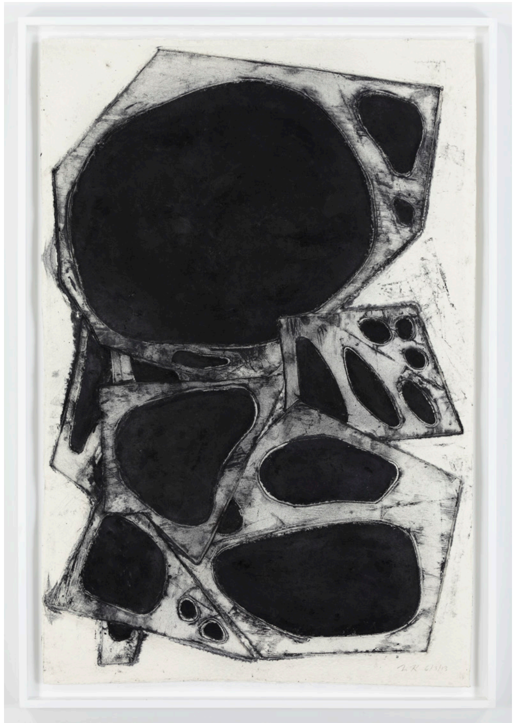
Water Drawing (C) , 2012 cast paper with carbon black pigment 60 x 40 in 152.4 x 101.6 cm (KEN4938)