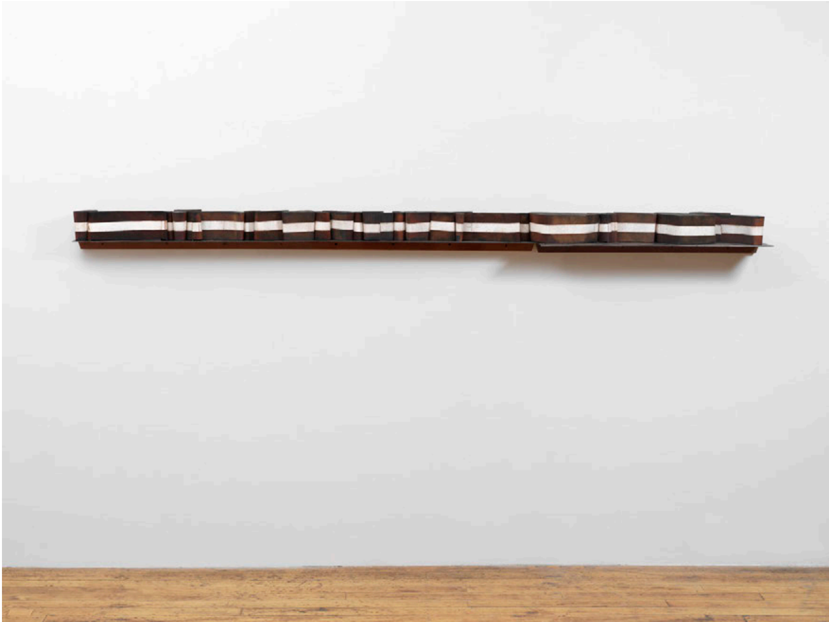
White Line , 2019 ebonized mahogany and EPS foam, on steel and mahogany shelf 4 1/2 x 108 x 9 in (11.4 x 274.3 x 22.9 cm) shelf: 2 x 108 x 7 3/4 in (5.1 x 274.3 x 19.7 cm) (KEN7532)