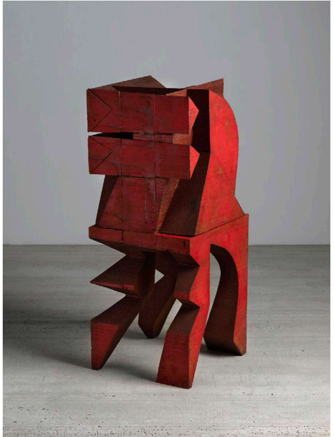
Untitled, 2007 mahogany and Japan color 32 x 12 x 13 in 81.3 x 30.5 x 33 cm (KEN5065)