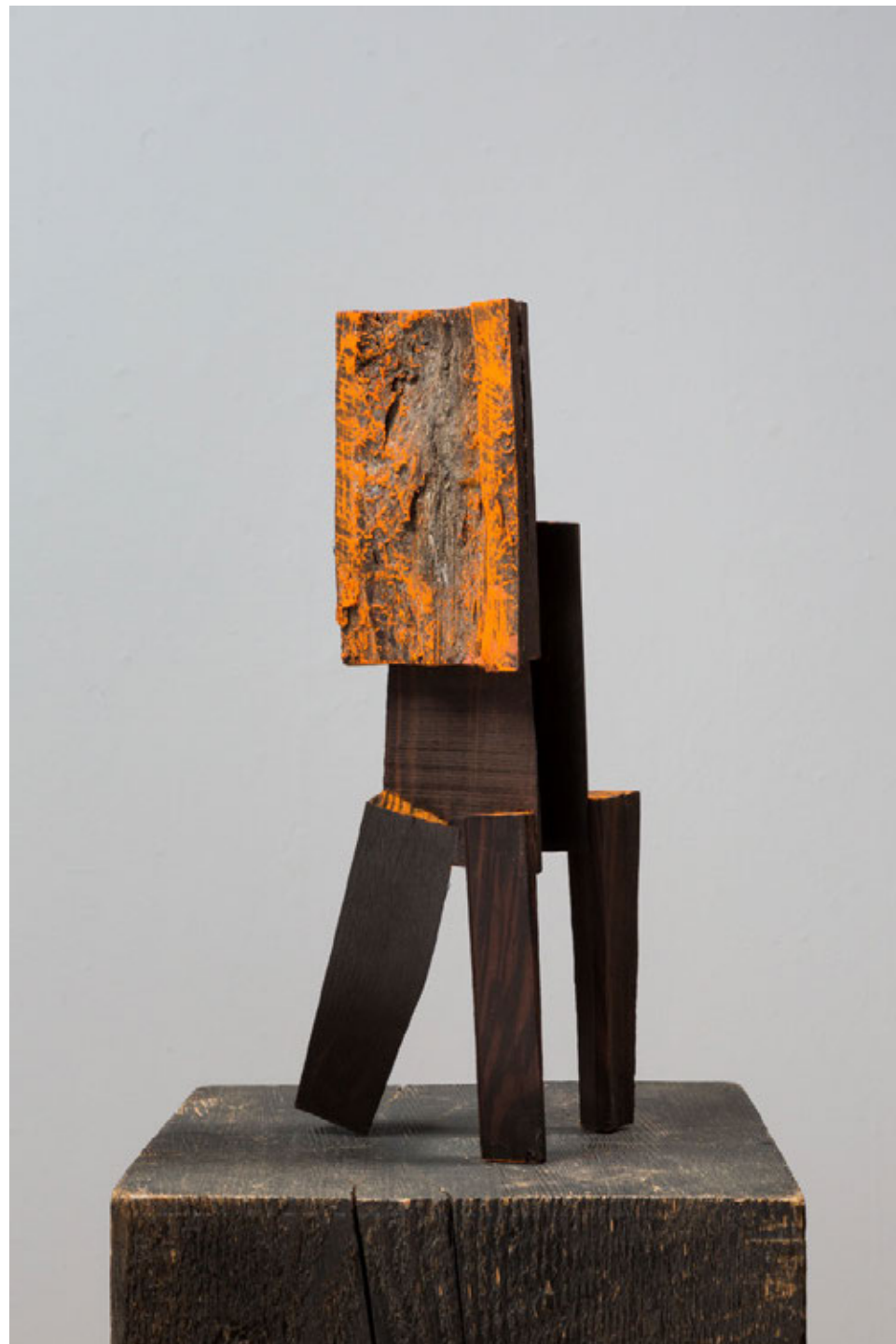
Untitled , 2018 ebony and Japan color 4 x 5 1/2 x 13 3/4 in 10.2 x 14 x 34.9 cm (KEN7548)