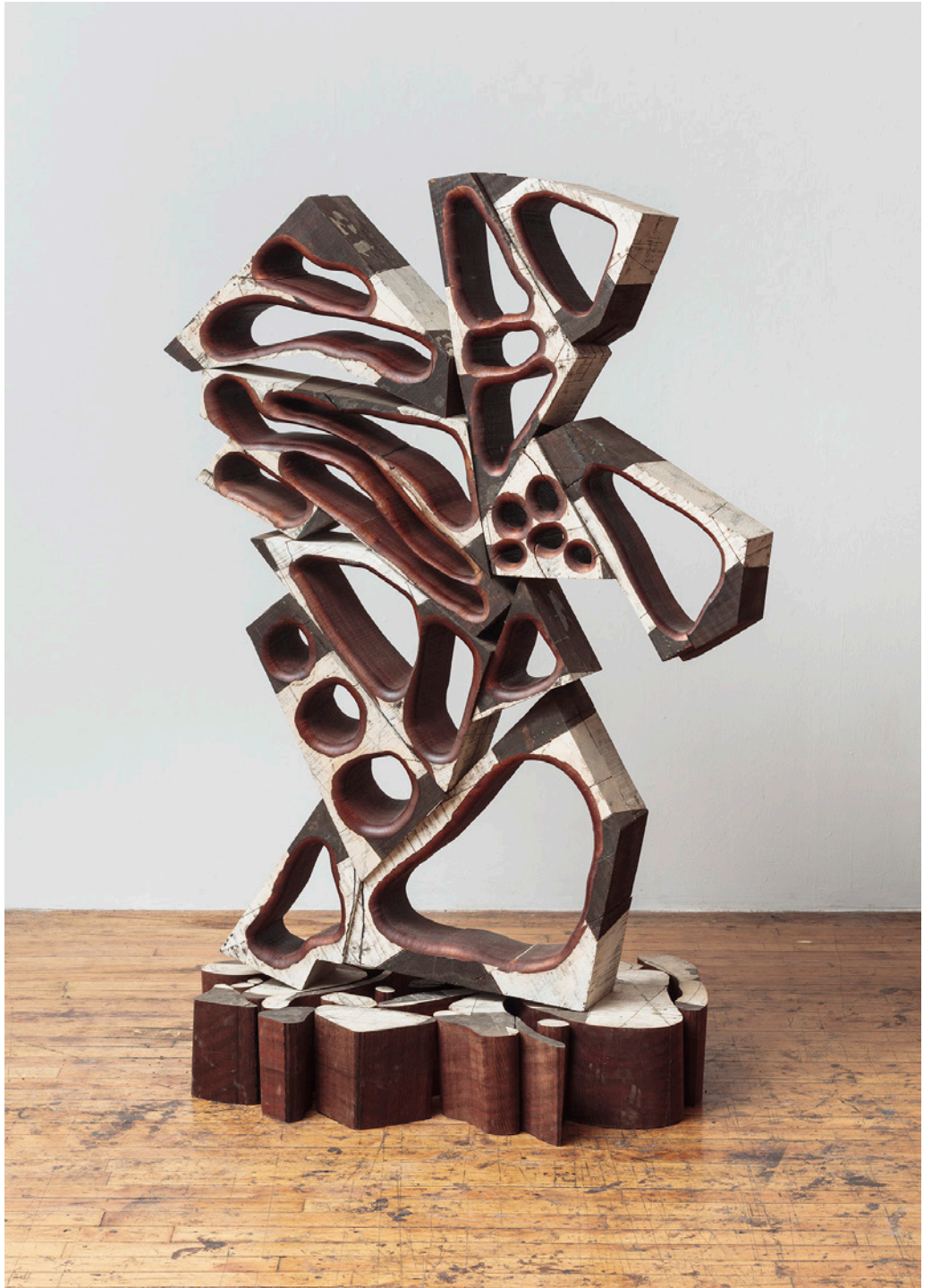
Untitled, 2018 mahogany and Japan color 66 x 49 x 12 in (167.6 x 124.5 x 30.5 cm) base: 8 x 41 x 31 in (20.3 x 104.1 x 78.7 cm) (KEN7151)