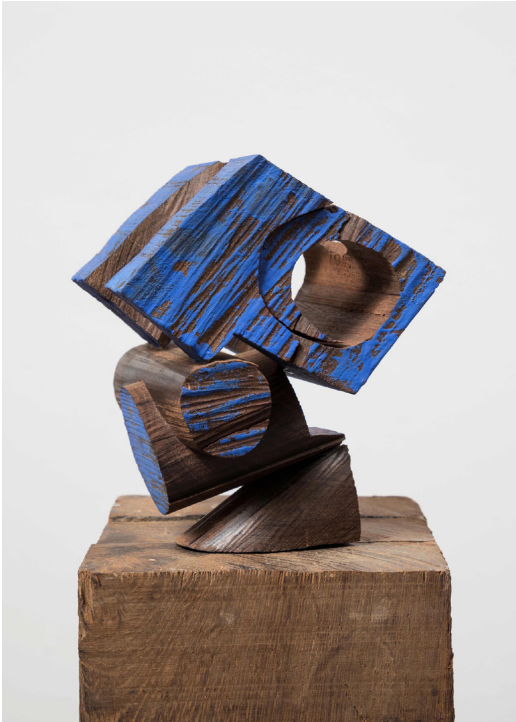
Untitled, 2018 mahogany and Japan color 5 3/4 x 4 3/4 x 7 in 14.6 x 12.1 x 17.8 cm (KEN7547)