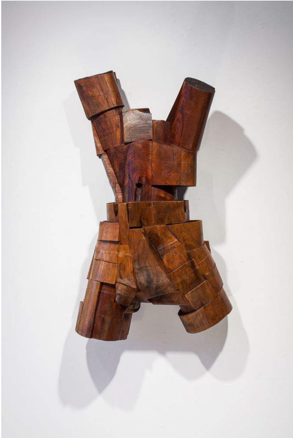
X2, 2006 wood, steel, and plastic 36 x 19 1/2 x 5 1/8 in 91.4 x 49.5 x 13 cm (KEN3305)