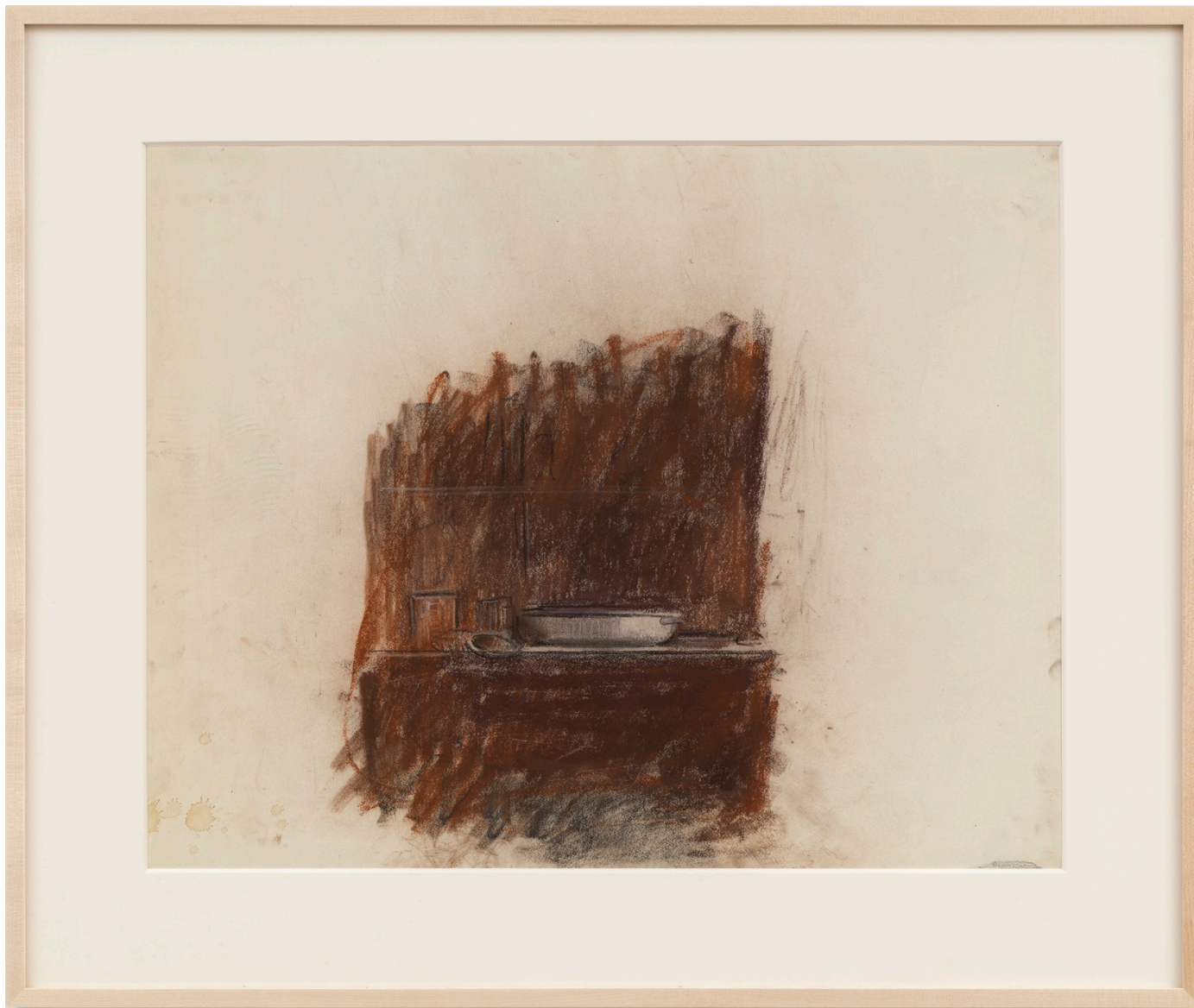
Kitchen Cupboard 3 , ca. 1973 chalk and charcoal on paper 19 1/2 x 24 in (49.5 x 61 cm) (MOY8081)