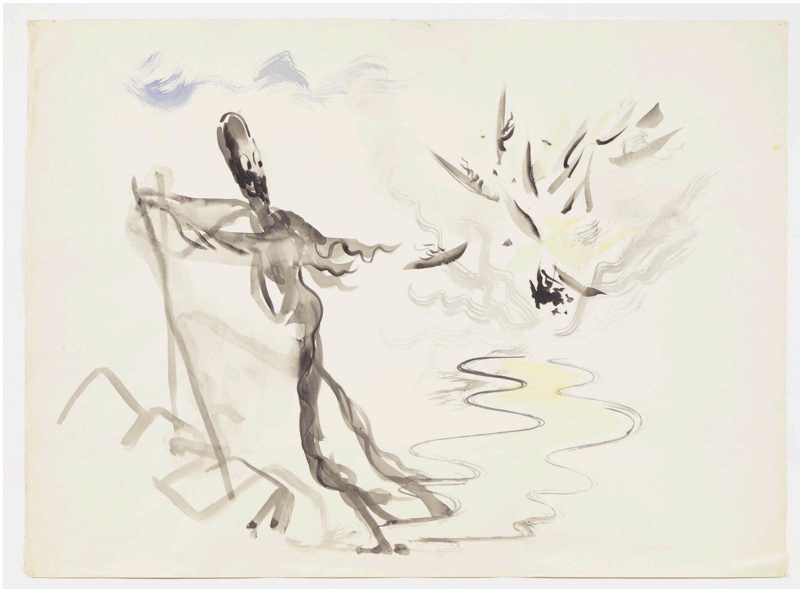
George Grosz (1893-1959) Stickman in Refuge , 1949 watercolor on paper 18 7/8 x 25 11/16 in (48 x 65.3 cm) (GG5423)