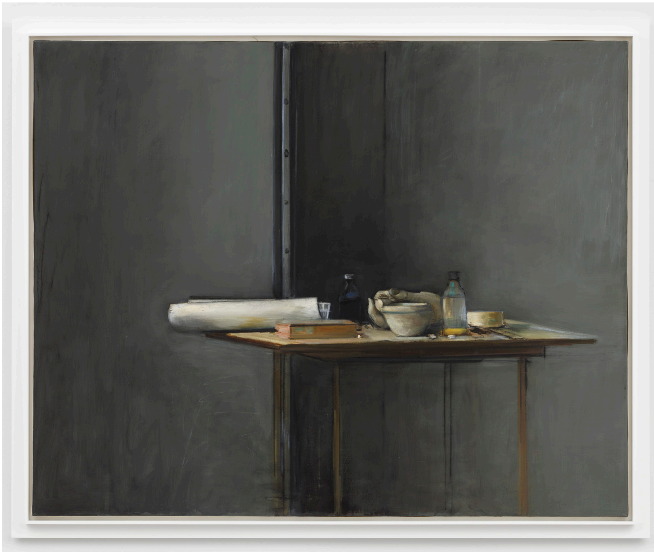
Still Life with Roman Hand & Roll of Photographs I , 1988 oil on canvas 40 x 50 in (101.6 x 127 cm) (MOY8058)

In Still Life with Roman Hand & Roll of Photographs I and Still Life with Roman Hand & Roll of Photographs II (both 1988), painted near the end of his life, Moynihan employs slate and soot gray to depict the studio walls. In both paintings, there is silvery gray band that vertically divides the room into two unequal areas. While it is the same table, the things on it have been moved around, most likely because Moynihan used them. What unsettles the gathering is the Roman hand clutching something unidentifiable. Its presence on the table underscores Moynihan's observation that nothing is permanent, not even art.