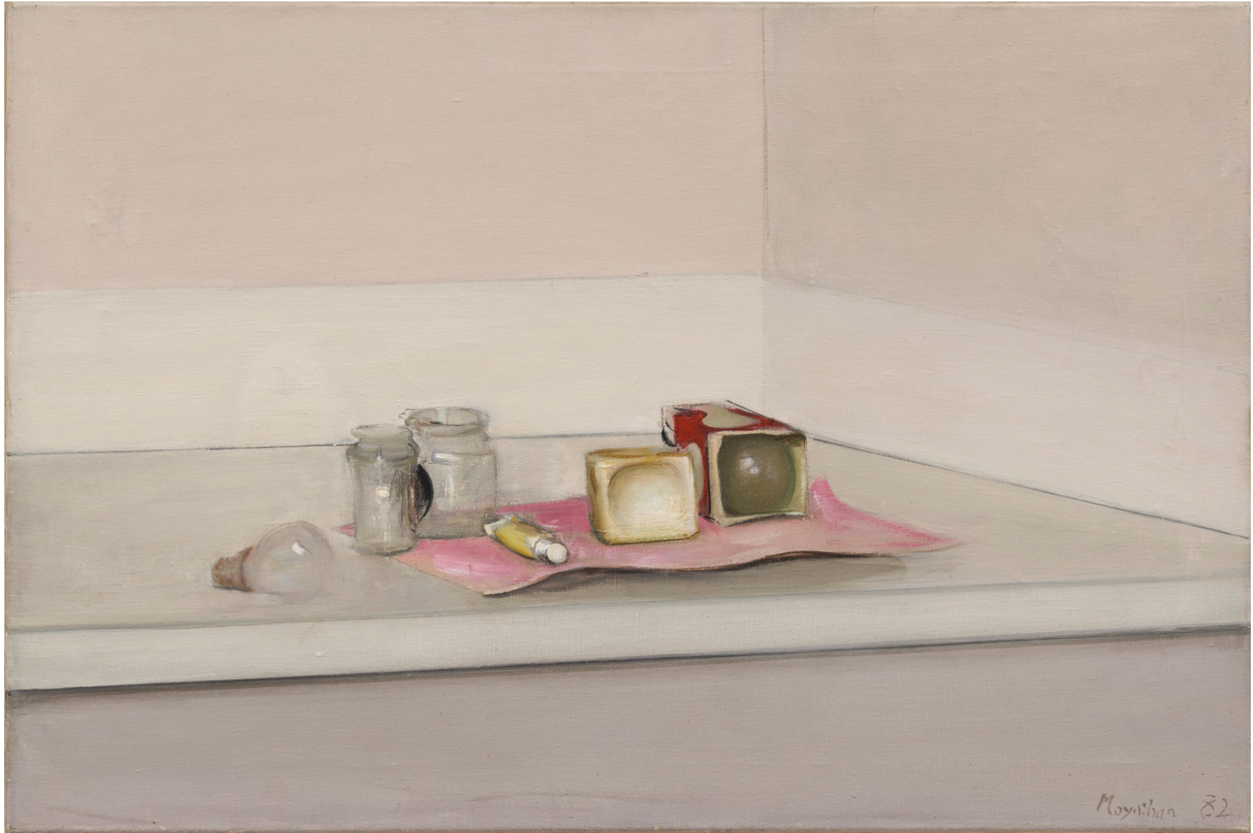
Jars, Soap and Light Bulb , 1982 oil paint on canvas 20 x 30 in (50.8 x 76.2 cm) (MOY7776)