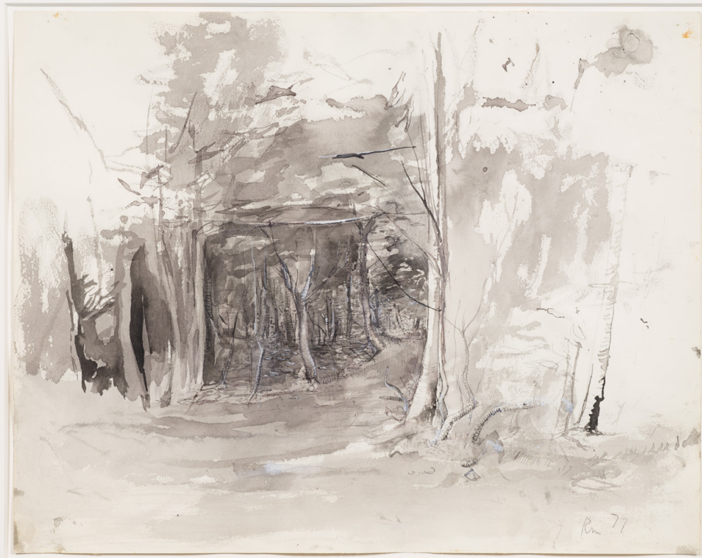
Landscape, 1977 ink and gouache on paper 17 1/2 x 22 1/4 in (44.5 x 56.5 cm) (MOY8066)