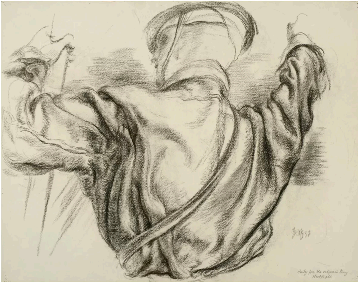
George Grosz (1893-1959) Study for "Streetfight" , 1937 charcoal on paper 19 x 24 3/4 in (48.2 x 63.1 cm) (PP0567)