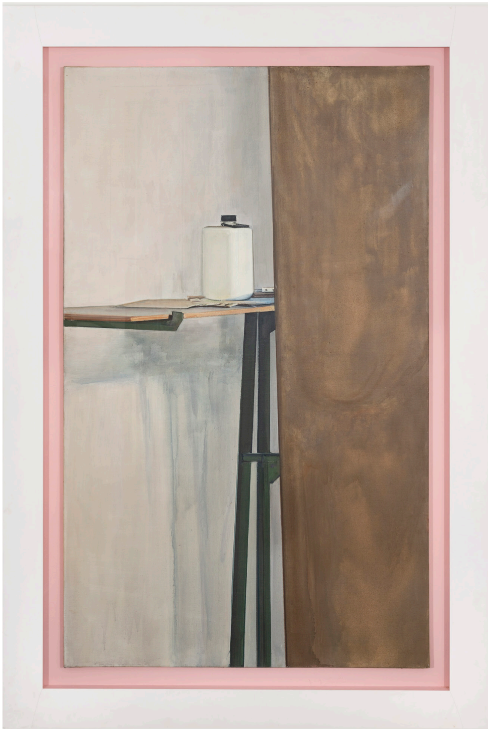
White Plastic Container behind Plywood Board , 1973 oil on canvas 70 x 47 in (177.8 x 119.4 cm) (MOY8431)