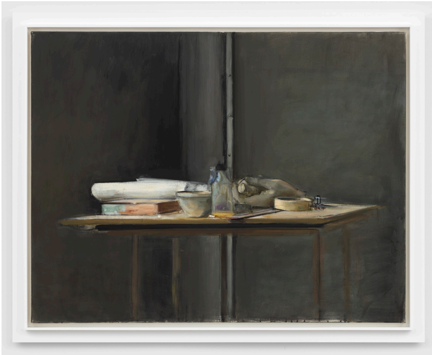
Still Life with Roman Hand & Roll of Photographs II , 1988