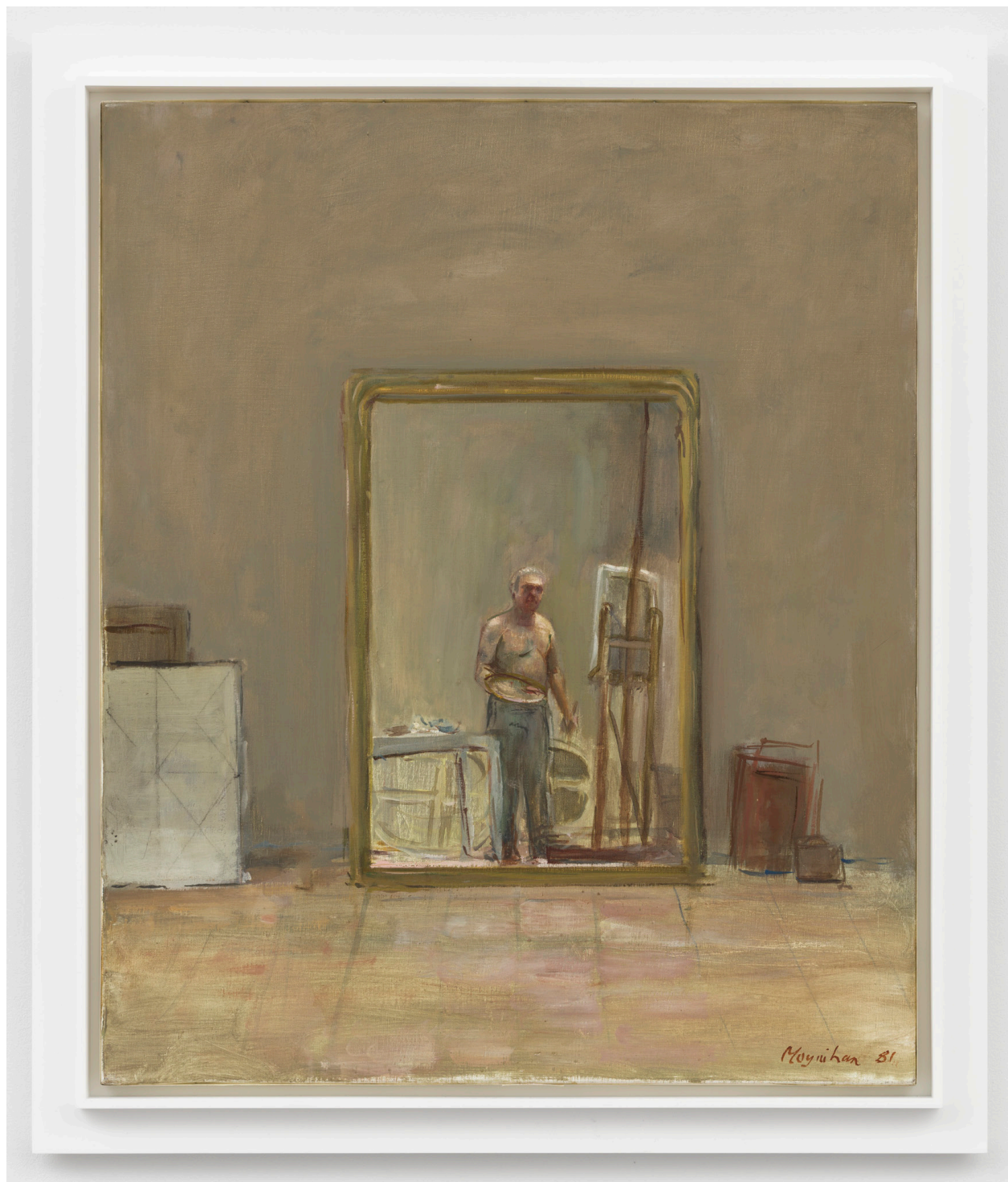
Summer Interior , 1981 oil on canvas 25 1/2 x 21 1/4 in (64.8 x 54 cm) (MOY8050)