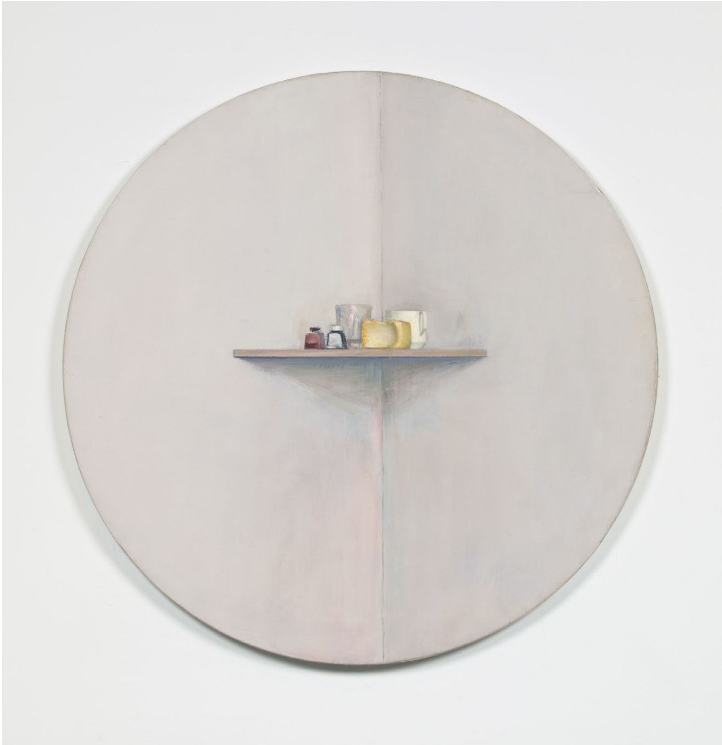
Corner Shelf , 1974 oil on canvas diameter: 39 3/8 in (100 cm) (MOY8045)