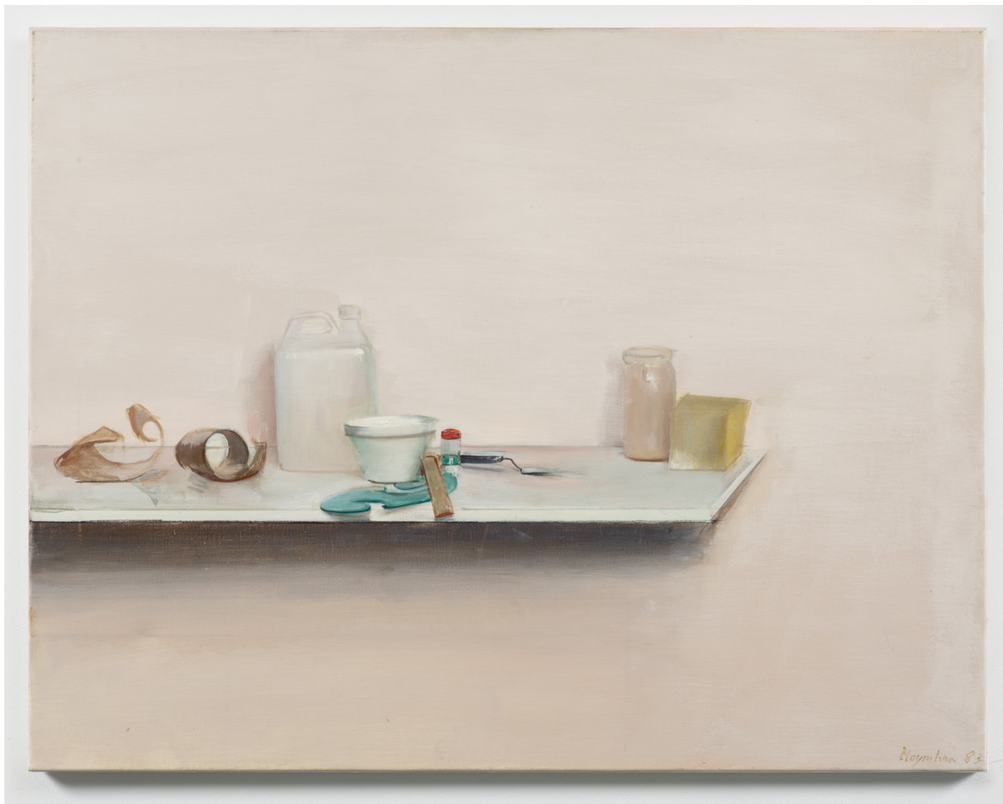
Rolled Paper, Container and Jars , 1982-83 oil on canvas 27 3/4 x 36 in (70.5 x 91.4 cm) (MOY8055)

In his still life paintings, the objects (or what I have come to think of as recurring characters) include: sponges, soap, light bulbs, often still in their cardboard boxes, rulers, rolls of photographic papers, bottles, jars, pieces of paper, maul stick, palette knife, and a second-century Roman head and hand. The objects stir up faint associations with the tools of surgeons and architects, which fold another layer of meaning into the painting.