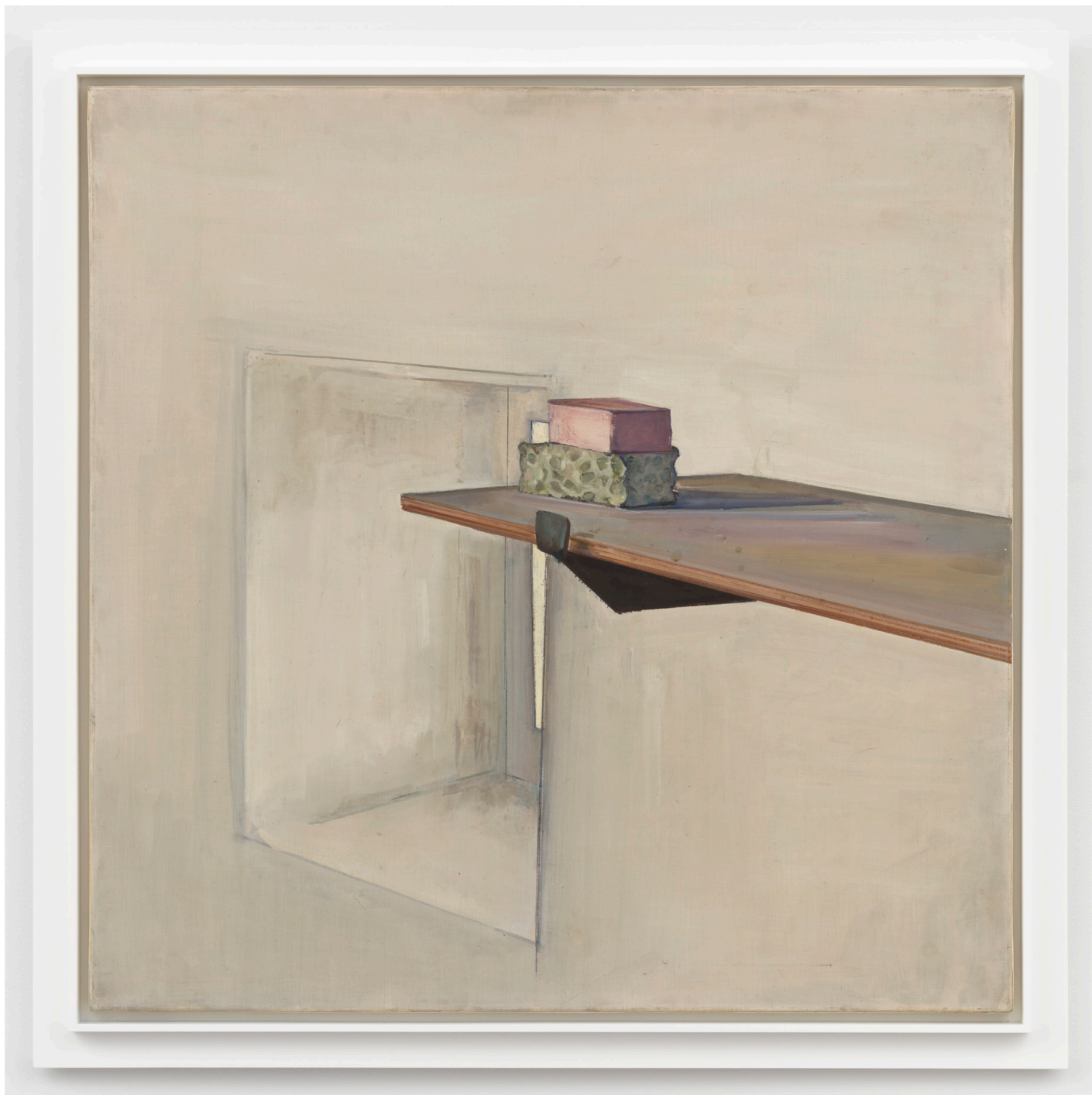
Sponges Near a Window , 1973 oil on canvas 29 1/2 x 29 1/2 in (74.9 x 74.9 cm) (MOY8054)