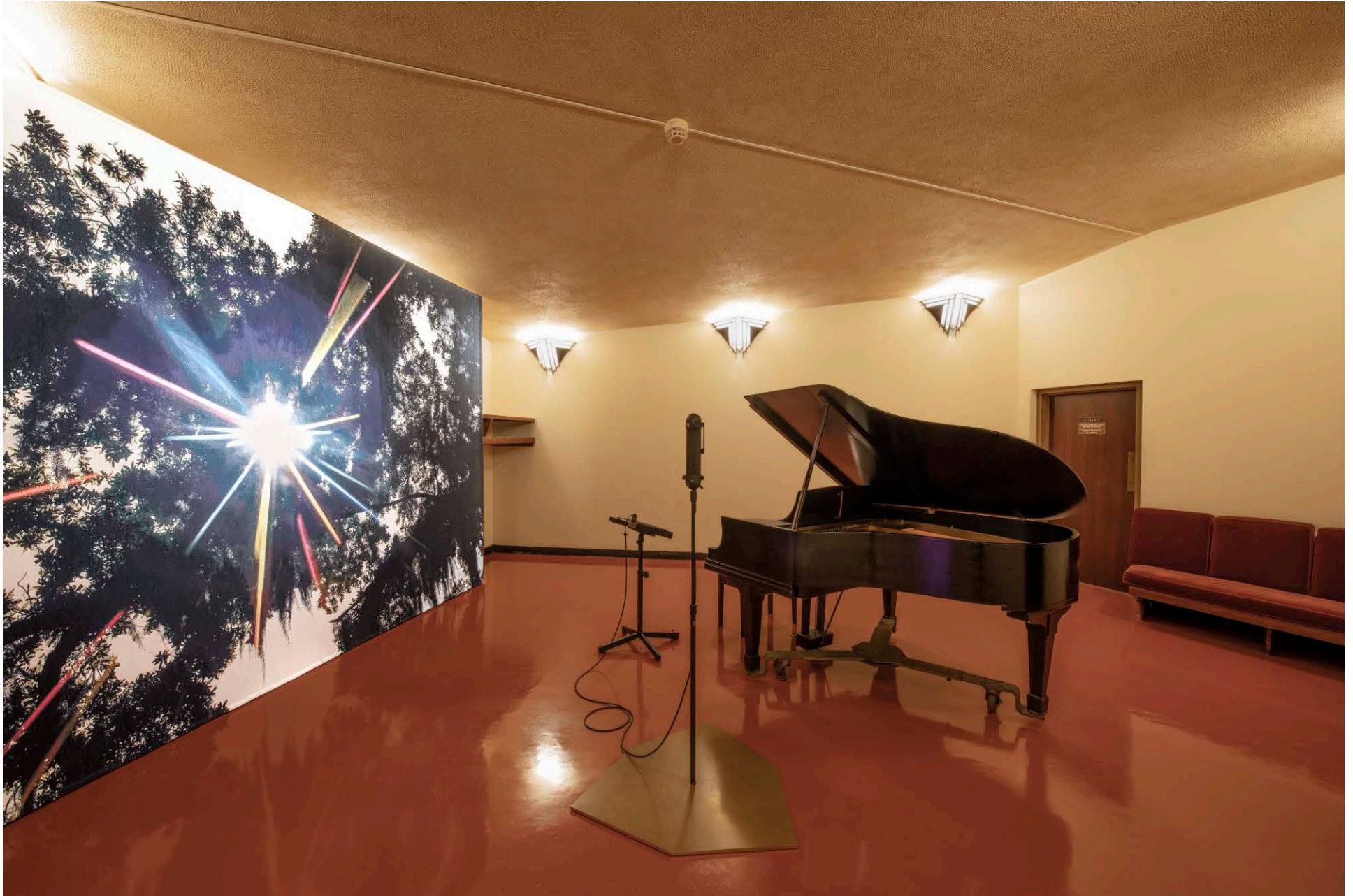
Installation view, The Histories (Le Mancenillier) , Beth Sholom Synagogue, a Frank Lloyd Wright designed National Historic Landmark, Elkins Park, PA, 2019