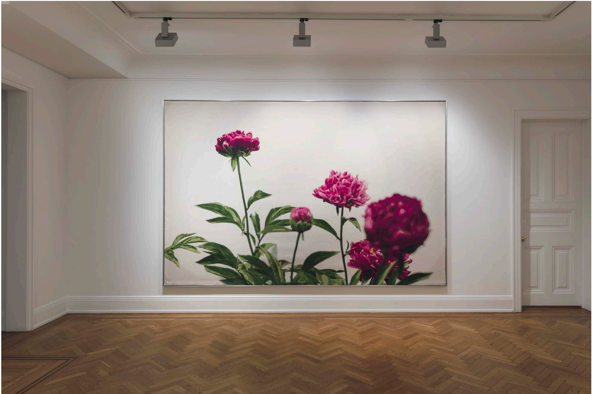
Installation view, Et in Arcadia Ego , David Nolan Gallery, New York, NY, 2022