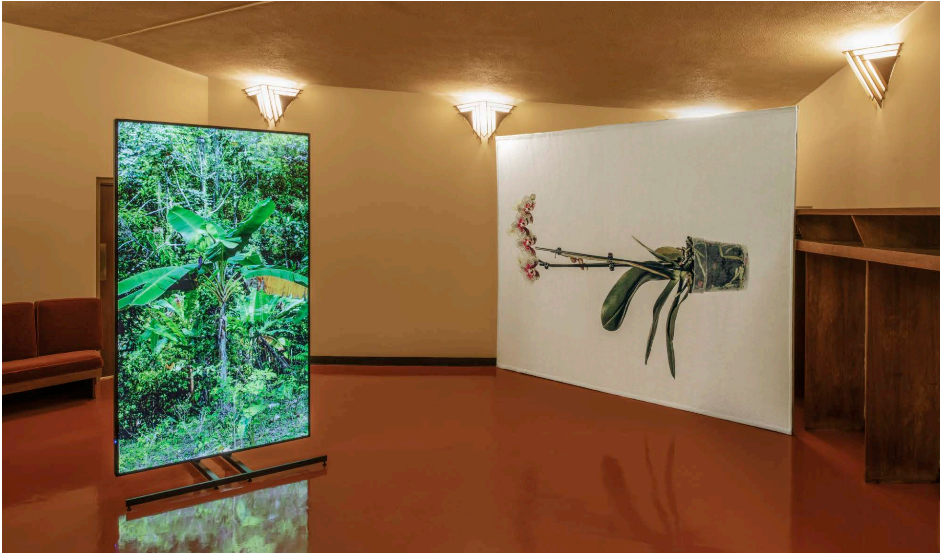
Installation view, The Histories (Le Mancenillier) , Beth Sholom Synagogue, a Frank Lloyd Wright designed National Historic Landmark, Elkins Park, PA, 2019