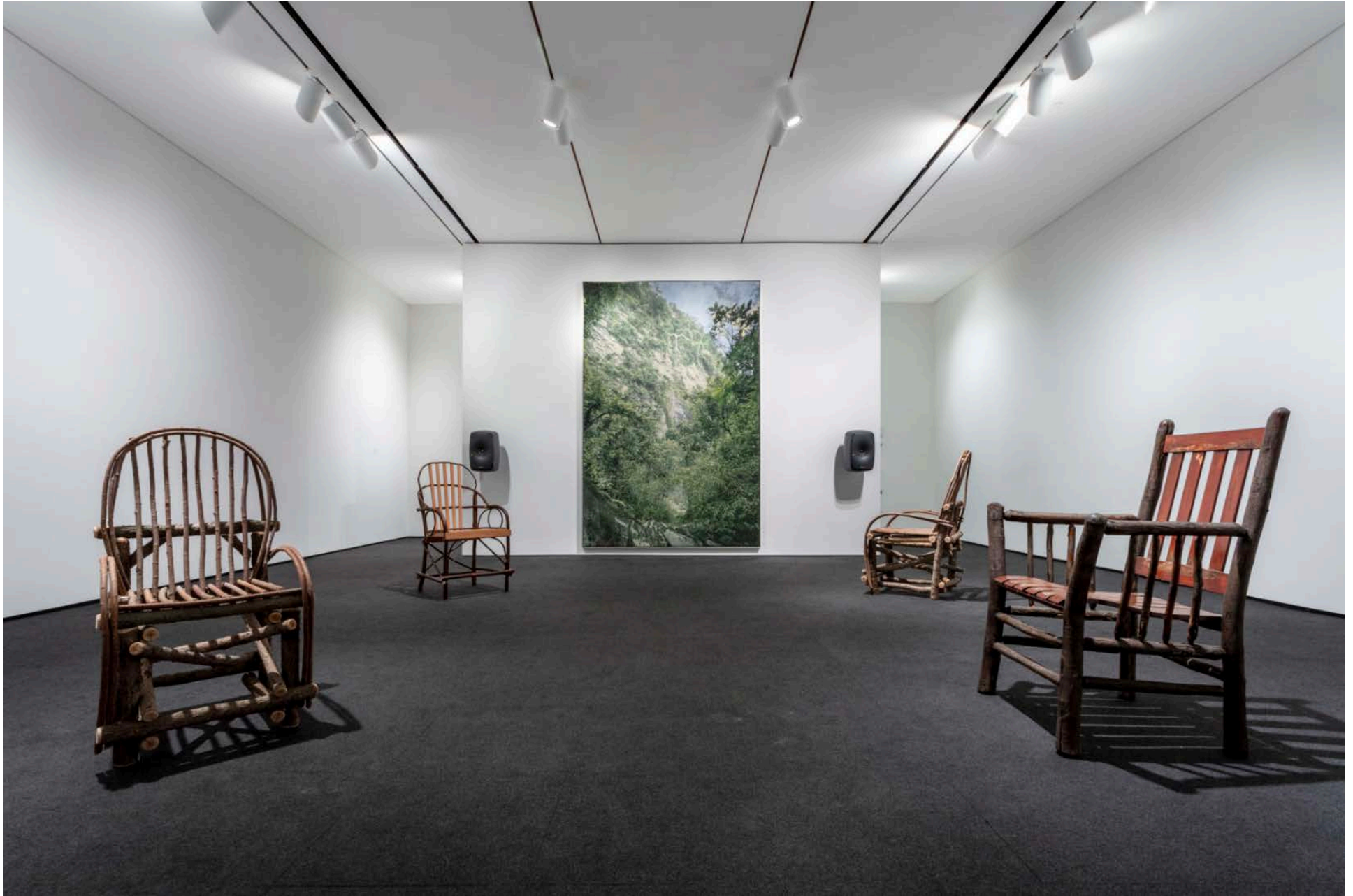
Installation view, The Histories (after Cazabon) , Hammer Projects: David Hartt, The Hammer Museum, Los Angeles, CA, 2021